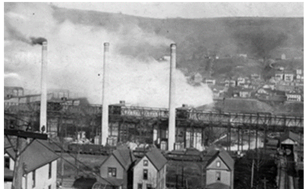
Above: An example of incompatible uses next to each other.

Setbacks are the minimum distances a building can be located from a property line. This keeps homes from being placed too close together. Setbacks may vary by neighborhood based on zoning district type.