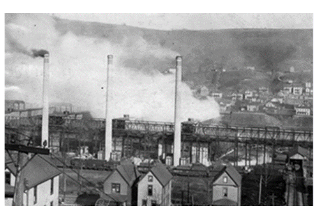
Above : An example of incompatible uses next to each other.

Zoning lets property owners know what they can do with their property and what to expect from their neighbors. It helps residents predict how their communities will evolve.